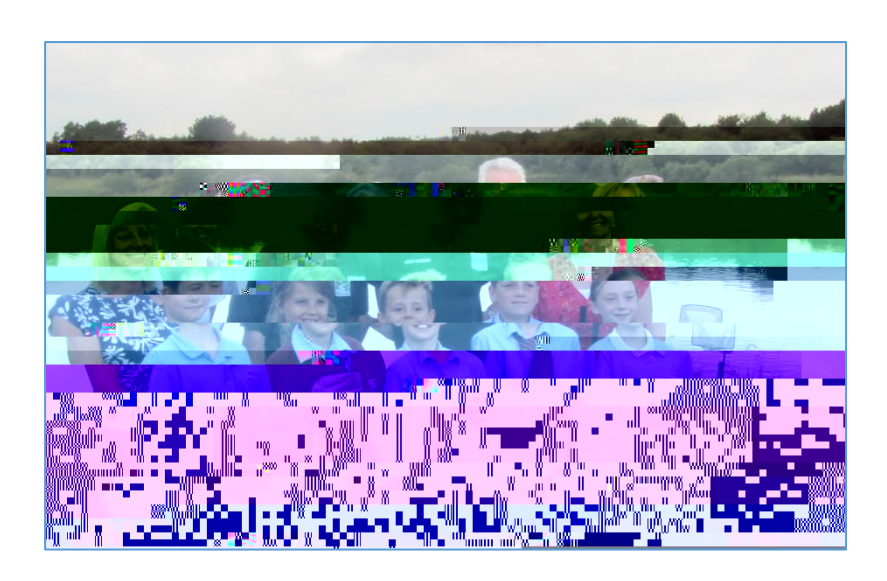
Figure 10: Children from Beaufort Hill Primary School took part in 'Eels in the Classroom' project and helped to look after the enreu) e en fre